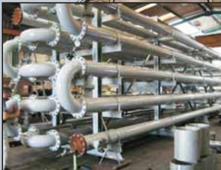
Monsal Hot Water Heat Exchanger Module