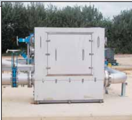
Monsal Steam Heating Module